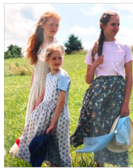
Photo Reference Examples Please Bring 6 Each, Figure and Landscape- Background